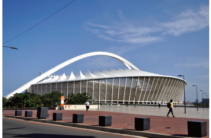
The modern design of the Moses Mabhida stadium is a striking addition to the Durban, South Africa cityscape.

One of the most important aspects of keeping stadium operations running smoothly are the kitchens and the floors that support them. Planners knew that the kitchen floors in this